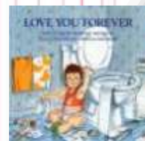
Robert Munsch E Mun