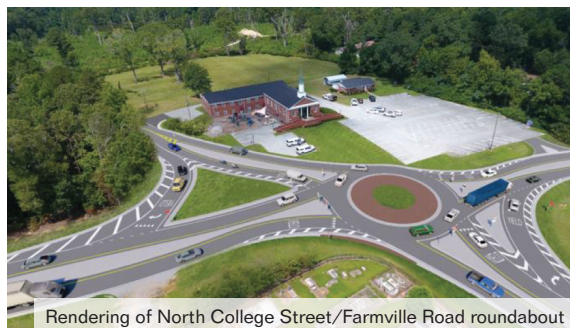
Rendering of North College Street/Farmville Road roundabout

Roundabouts are in the works for the intersection of Cox Road and Wire Road and the intersection of Farmville Road and North College Street. For years, these two intersections have been complicated and dangerous for travelers to navigate. Both of these intersections are controlled by the Alabama Department of Transportation (ALDOT), so we've lobbied for improvements for years. The results have paid off, and construction on roundabouts at these intersections is expected to begin in spring/summer 2020.