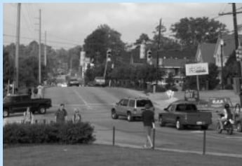
The Donahue Drive-Magnolia Avenue Intersection Improvements are top priority under the proposed list of projects for the Special Five Mill Referendum.

Survey and the priorities of the City Council. By focusing on infrastructure, the City can use accumulated Special Five Mill Tax Funds for essential projects without creating a strain on the General Fund during uncertain economic times.