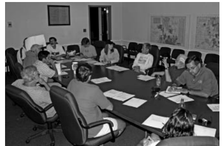
Citizen participation is an important part of Auburn's City government.

Survey results are tentatively scheduled to be presented to the City Council and citizens at the Tuesday, April 7 Committee of the Whole meeting. For more information, visit www.auburnalabama.org or contact Auburn City Hall at 501-7260.