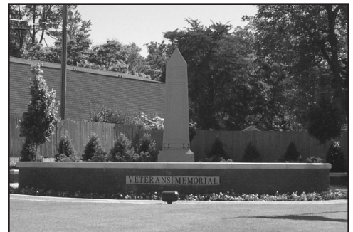
A Veterans Day ceremony will be held November 11.