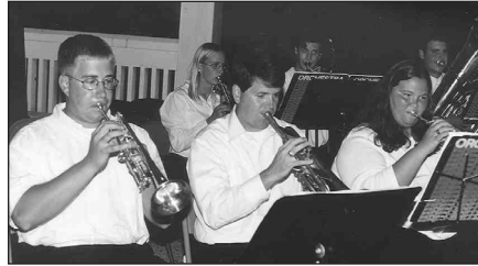
Auburn Community Orchestra

The Student Exhibition of Boys & Girls Club of Greater Lee County will be held during November 4 - 18 in the Jan Dempsey Community Arts Center Children's Gallery. This exhibition will feature works by area students involved in after-school art programs offered by the Boys & Girls Clubs of Greater Lee County.